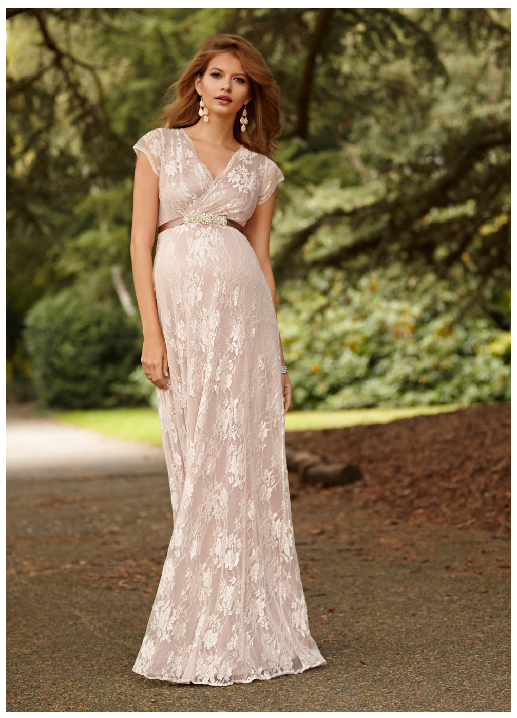
• EDEN GOWN BLUSH \sim \$425 •