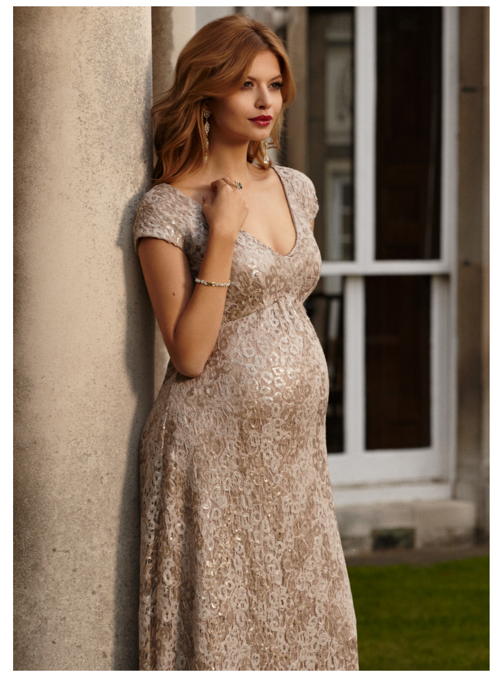
\cdot Carmen gown gold rush \sim \$495 \cdot