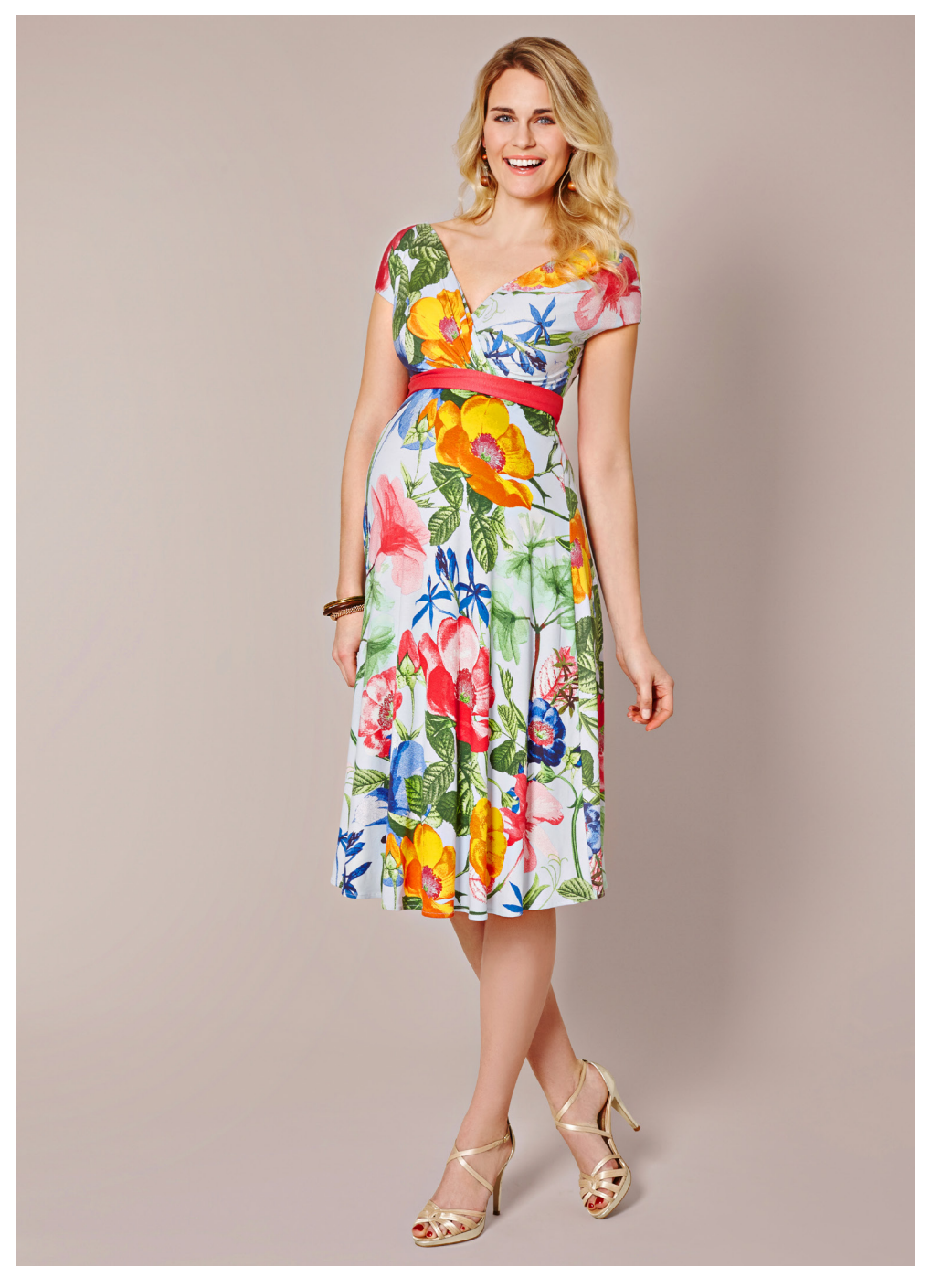
• HAWAIIAN BREEZE DRESS \sim \$170 •