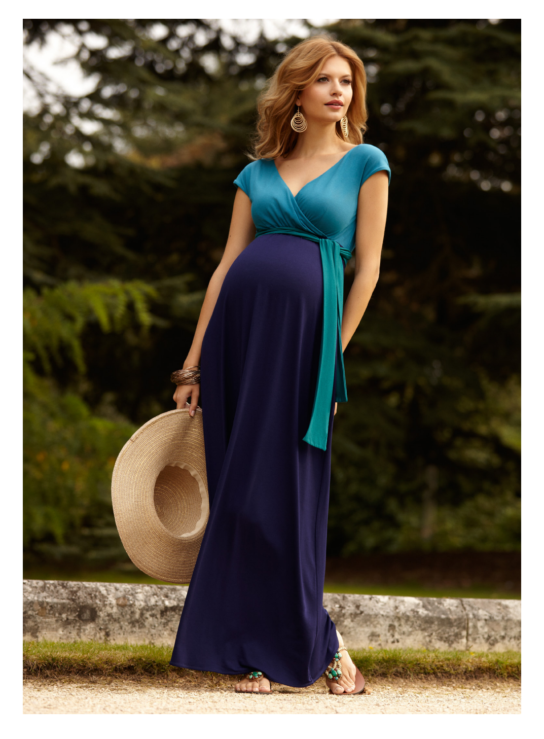
\cdot JEWEL BLOCK DRESS BISCAY BLUE \sim \$155 \cdot