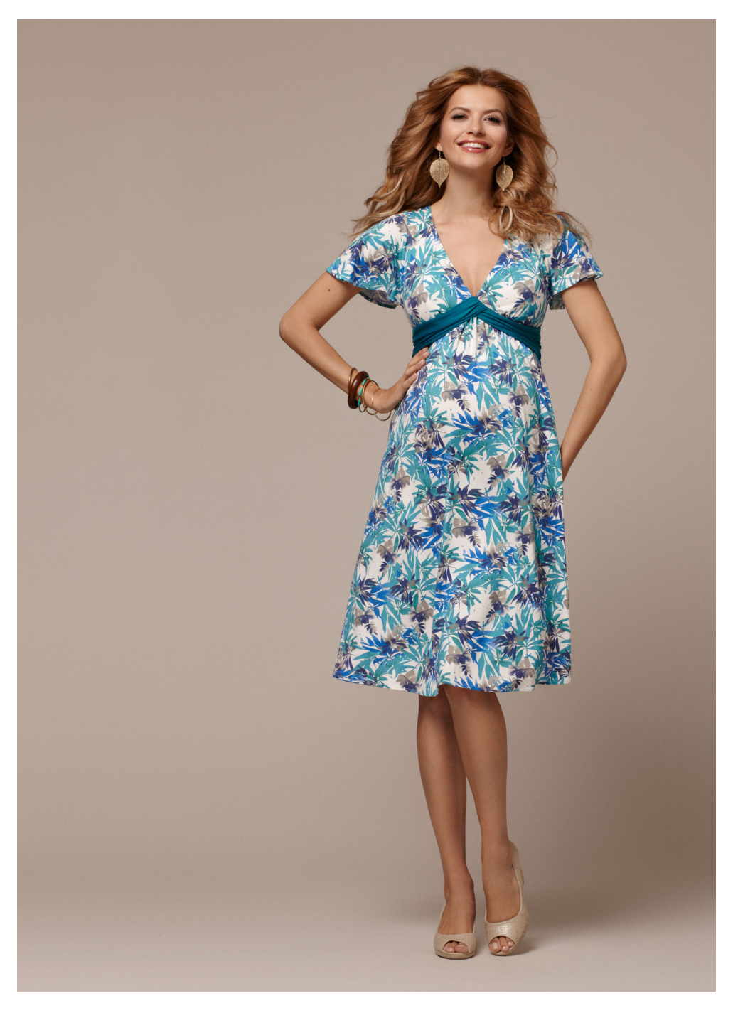
\cdot LIZZY DRESS BLUE NILE \sim \$205 \cdot