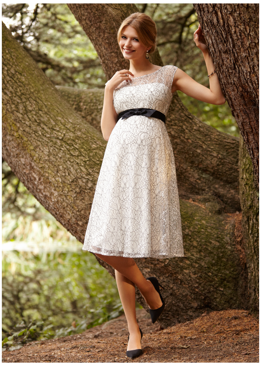
\cdot Daisy dress mono lace \sim \$255 \cdot