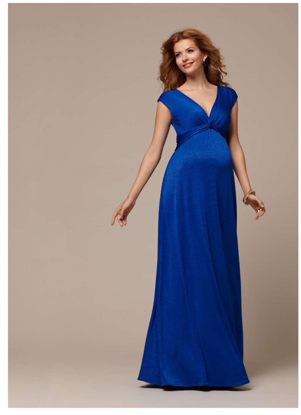
\cdot Clara gown cobalt blue \sim \$340 \cdot