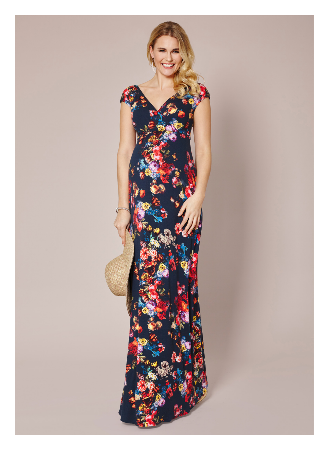
\cdot Floral maxi dress midnight garden \sim\$195 .